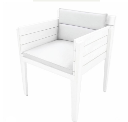
White Wood (Z01-02-15)