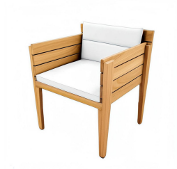
Sungkai Wood Clear Matt (Z01-01-08)