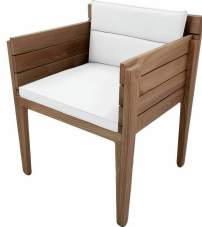
Mid Brown Wood (Z01-02-03)