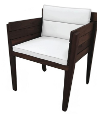
Dark Brown Wood (Z01-02-05)