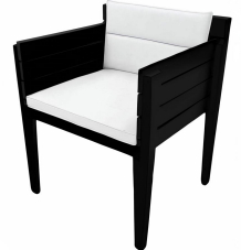
Black Wood (Z01-02-14)