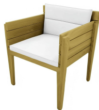
Honey Wood (Z01-02-02)