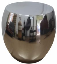
Polished Aluminium (Indoor only) (Z05-06-01)