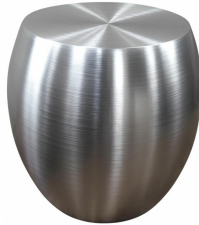
Satin Aluminium (Indoor only) (Z05-06-02)