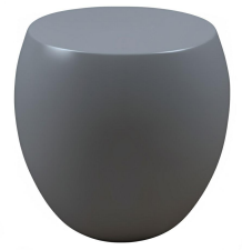
Powder Coat Aluminium, Silver Grey (Z05-06-05)