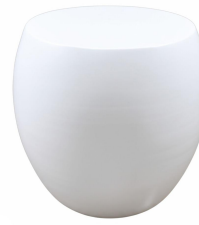
Powder Coat Aluminium, White (Z05-06-04)