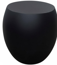
Powder Coat Aluminium, Black (Z05-06-03)