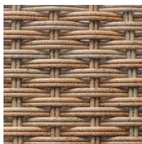
(Viro Twin Peel) V6A061 Natural (Z08-04-03)