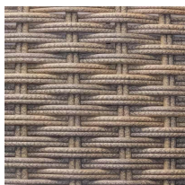
(Viro Twin Peel) V6A067 Summer Grass (Z08-04-01)

Are you selecting to order? Please copy all of the information below your selection and paste into our Options spreadsheet . Download the options spreadsheet in the Options section www.zenddu-catalogue.com