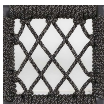
(MKI Acrylic) Rope Round ACR-R15 (Z09-02-06)