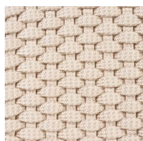
(MKI Acrylic) Rope Flat ACR-F6 (Z09-02-01)

Are you selecting to order? Please copy all of the information below your selection and paste into our Options spreadsheet . Download the options spreadsheet in the Options section www.zenddu-catalogue.com