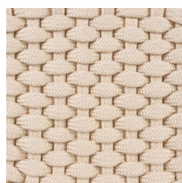
(MKI Acrylic) Rope Flat ACR-F10 (Z09-02-02)