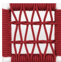
(MKI Acrylic) Rope Round ACR-R20 (Z09-02-07)