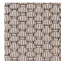
(MKI Acrylic) Rope Flat ACR-F4 (Z09-02-05)