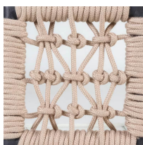
(MKI Acrylic) Rope Round ACR-R11 (Z09-02-03)